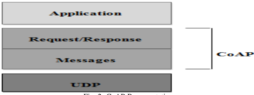
Fig. 2. CoAP Representation

Constrained Application Protocol, (CoAP) is a messaging & synchronous request- response protocol [4] that uses REST architecture. Many of the IoT devices are resource controlled. CoAP was proposed to transform a few HTTP functions to satisfy the needs for IoT & executed bymeans of HTTP methods like GET,POST,PUT,DELETE[5]. UDP is an unreliable protocol & it is the governing protocol for CoAP that minimizes bandwidth needs by eradicating TCP overhead [6]. Fig.2 reflects the representation of CoAP.